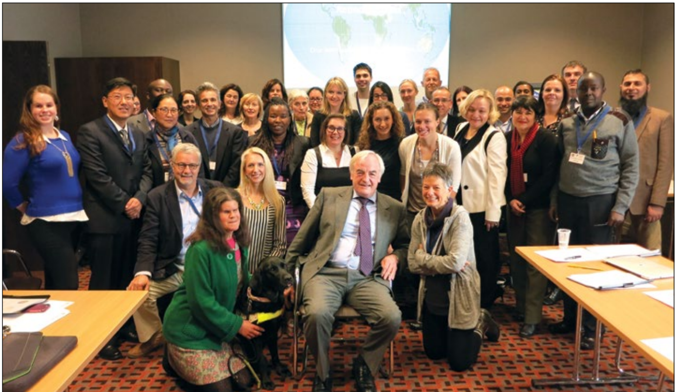
Delegates at the One Retinoblastoma World 2016 conference in Dublin, Ireland.